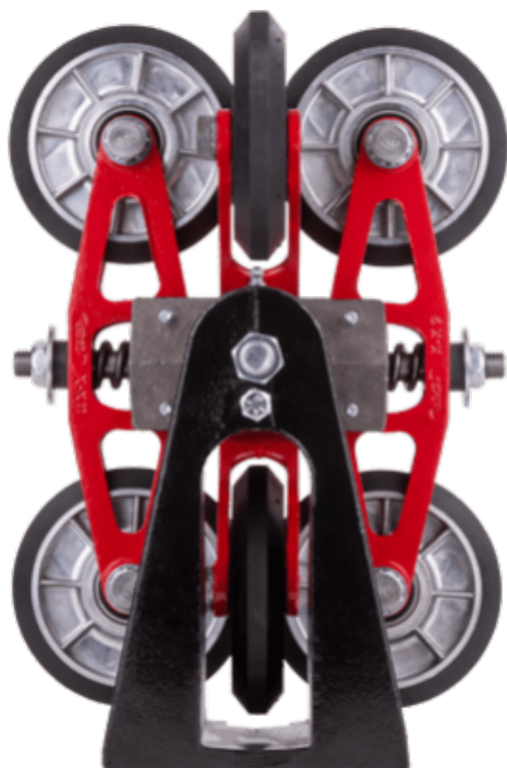
MODEL A - The industry's gold standard for elevator ride quality for over 70 years