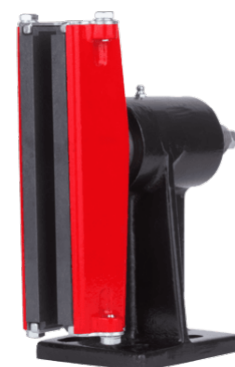
Swivel Slide Guides - ELSCO's unique slide guides with spring suspension and adjustable stops