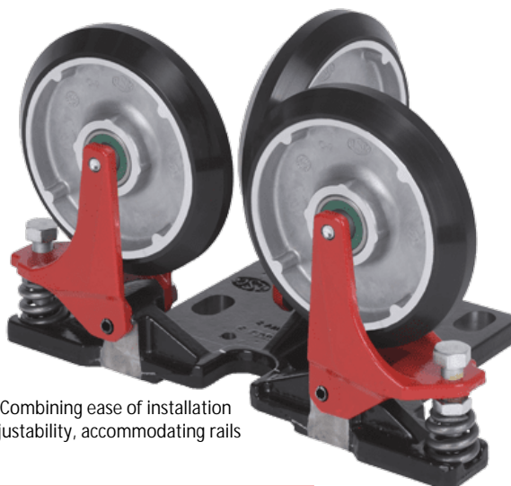
CALIBRE C-150 - Combining ease of installation and hoistway adjustability, accommodating rails from 9 to 19mm